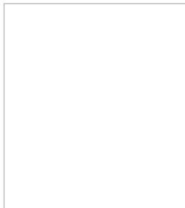
Case State filter

The Case State filter allows you to sort cases per assigned State. For more information, see For more information, see Case State .