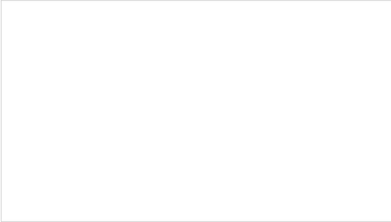
Custom Survey Fields overview

Nine custom survey fields are available for customization. Custom survey fields that are edited here appear in the Save Survey Response block in the Scenario Builder application, and in the Survey Form Editor application. If no custom survey fields are defined, the field is shown as "<empty>."